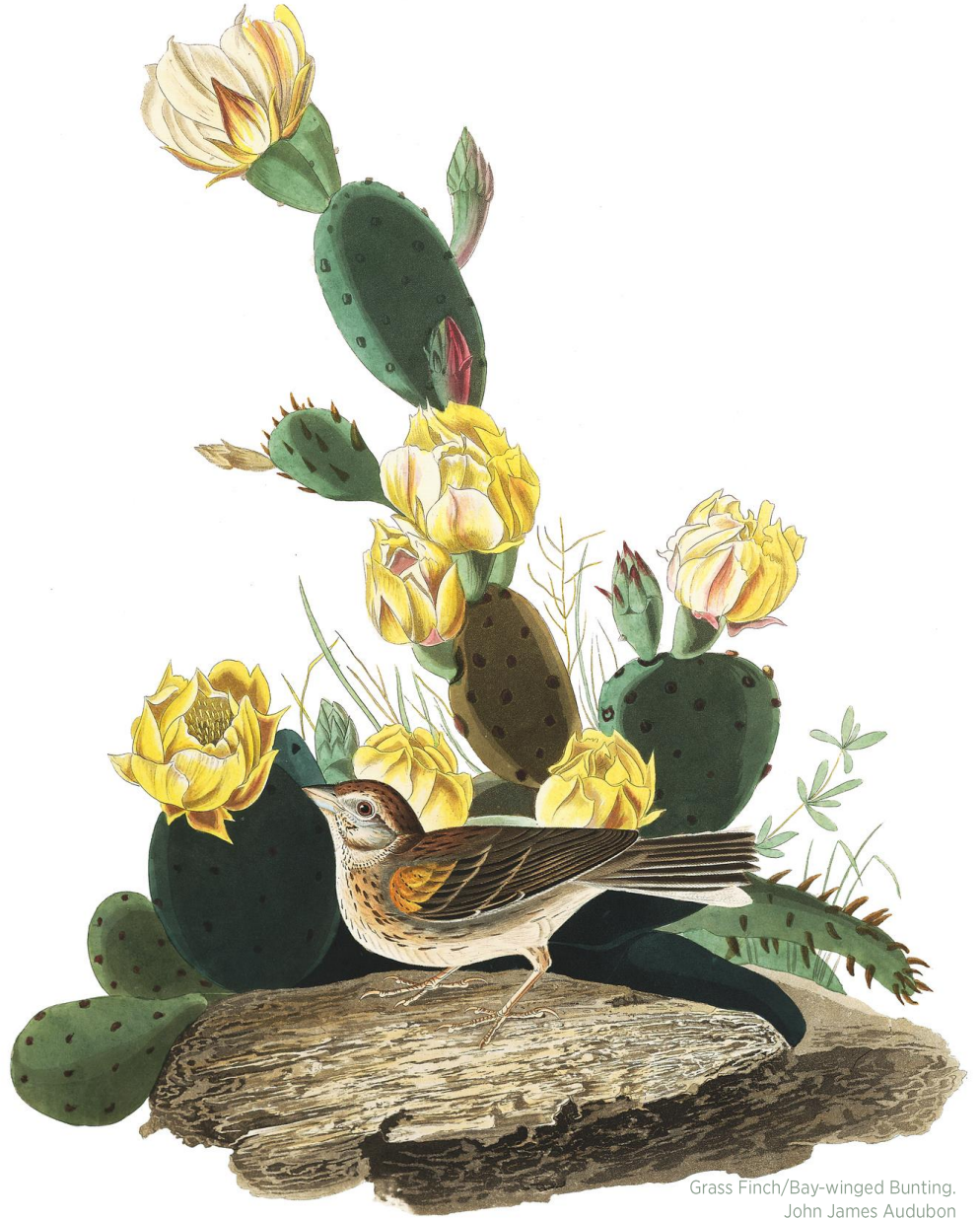
Grass Finch/Bay-winged Bunting. John James Audubon