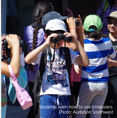
Students learn how to use binoculars.

Learn about Sonoran Desert Wildlife with Audubon Southwest's Nature in Your Neighborhood virtual presentation for Grades K – 8 th .