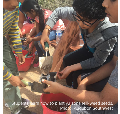
Students learn how to plant Arizona Milkweed seeds.