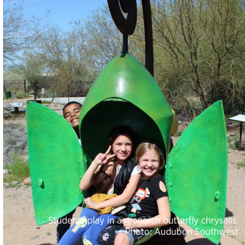
Students play in a green butterfly chrysalis.